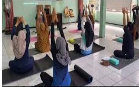
Figure 2 When Pregnant Exercise Practices