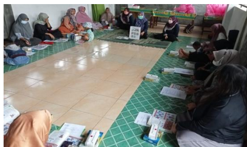
Figure 1 During counseling

After providing counseling, we continued by carrying out gymnastics practices during the exercise guided by members of the service team and pregnant women followed the directions of the pregnancy exercise guide according to those in the leaflet and were very enthusiastic and happy with the pregnancy exercise activities held at TPMB Miftahul Khoiriyah, S.Keb. Bd.