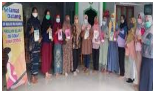
Figure 3 Completed Activity

Next, conducting Q&A in the Q&A session gave pregnant women the opportunity to conduct Q&A either about the counseling material or about the movements in the exercise given during pregnancy exercise, they were very enthusiastic in carrying out the Q&A. In the question and answer session there were 3 questioners. For those who asked questions, we gave door prizes. Door prizes were given to 3 questioners during the counseling or lecture. They were very happy because by coming to the pregnancy exercise, they not only got useful knowledge but also got a door prize. This door prize session is also used to evaluate this community service activity. From the evaluation results, it was found that all pregnant women already knew about the purpose and benefits of pregnancy exercise and the mothers were also willing to do pregnancy exercise independently at home even though there was no training schedule at TPMB.